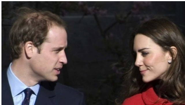
Prince William and Kate commoner will say to themselves "yes" April 29th. It seems to please everybody, so as Martin Amis. The author of "Money, Money" indeed judges that " something does not turn(shoot) circle in this history(story) ".

Keywords: Martin AmisThe United KingdomPrince WilliamDavid CameronElizabeth IINews